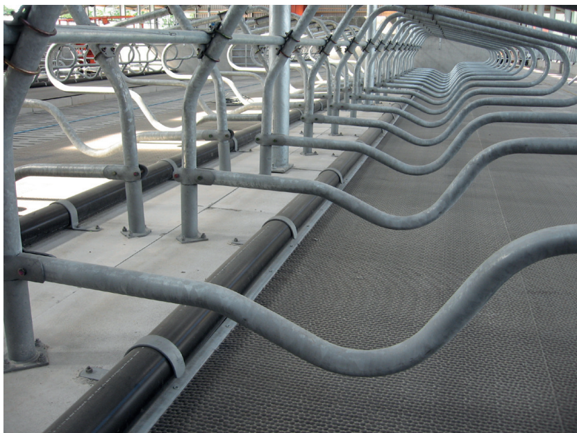
• Studded rubber mat