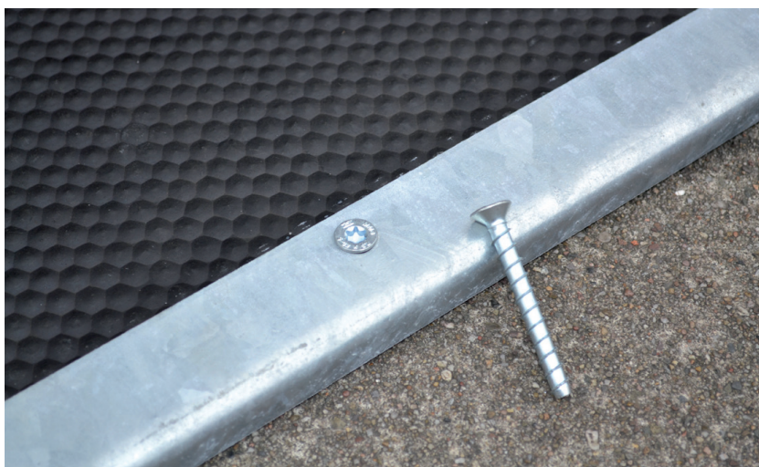
• Galvanized fastening profiles are installed with concrete screws