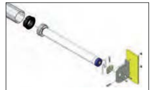
230V 11RPM motor