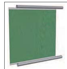
Sheets easily replaceable in the event of accidental damage