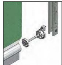
Long lasting nylon wind lockers for stability