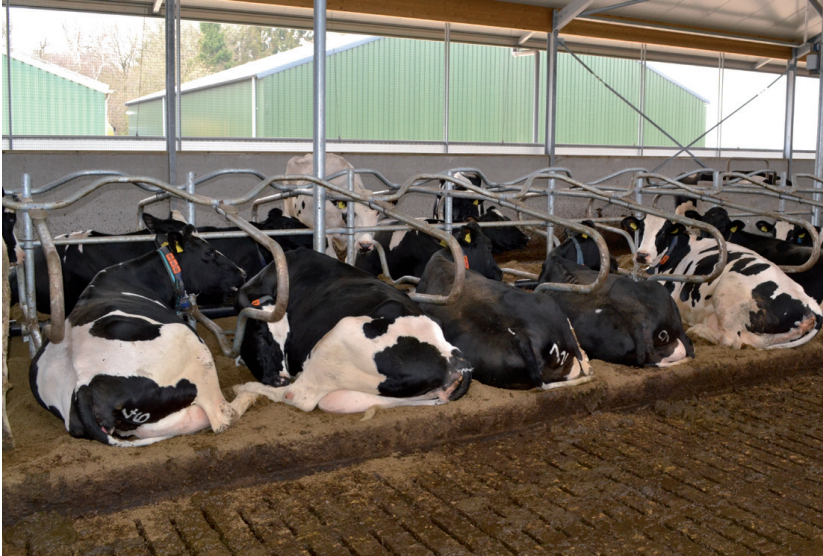
01.10.513 / 01.10.510 / 01.10.500 Model 'Profit' 216 / 206 / 190 for cows